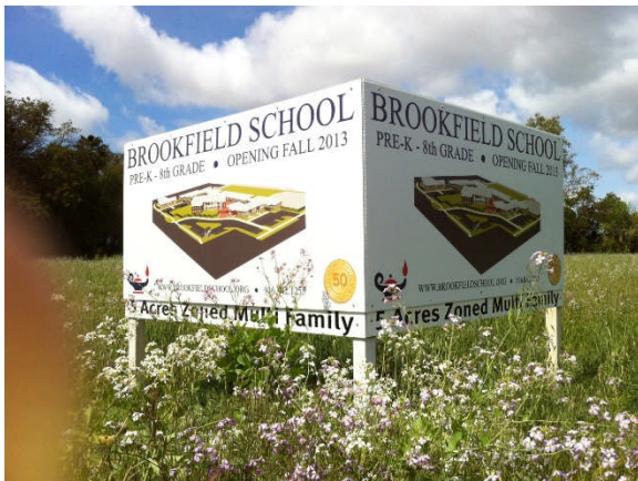
signage at the site of Brookfield's new campus

Brookfield School is planning to move soon! The teachers are planning and the kids are getting ready. We are moving so we can have a better school. We'll have bigger classrooms and air conditioning. We'll also have a sports field and an art room. I hope everyone likes the school!