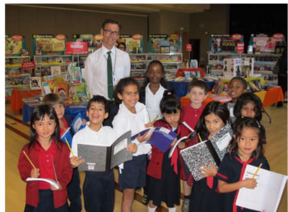
Tiny Eagle Press reporters at the book fair

Brookfield parents and students were there. Parents working there helped raise money for the school and so kids could buy books. There were all sorts of cool books. There were chapter books, dog books, animal books, other books and toys.