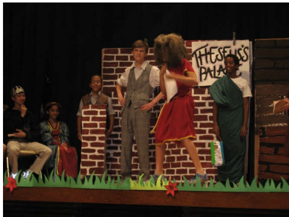
Brookfield upper school students perform in A Midsummer Night's Dream.

It was performed by the sixth, seventh, and eighth graders. The whole school was invited. The costumes were beautiful. All students got to dress up as Shakespeare, princesses, or in other costumes. We also got to eat lollipops during the performance. I loved this amazing play!