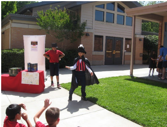
Student magicians perform at the 2013 entrepreneurial fair.