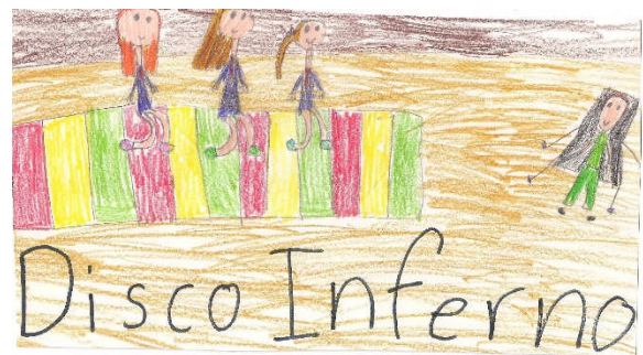
Disco Inferno illustration by Kaili Abay

When the event was almost here, we were nervous. When it started though, all of the dances were very good. Mr. Flolo was very proud. Lots of parents were there too.