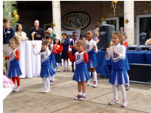
Brookfield cheerleaders at the celebration

The 50 th anniversary celebration was a big success!